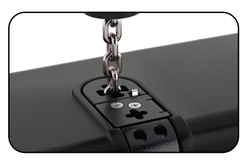
Low Profile Upper Limit Switch Protects the hoist from overwinding and offers exceptional headroom.

Under excessive loads will open gradually and not fracture. Ball bearings produce smooth rotation. Bottom hook will swivel 360 degrees. Heavy-duty hook latches are standard.