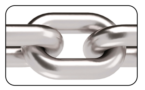
Nickel-Plated Load Chain Grade 80, super strength load chain with superior corrosion resistance.