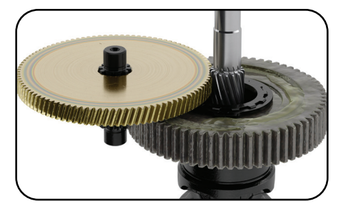
Grease-Packed Gearbox For demanding applications. Industry standard.

No mechanical contacts for extended lifetime and microcontroller provides protection from fast reverse, phase loss, & reversal (3ph), overcurrent, overtemperature, and overvoltage. Includes electronic overload limiter and an LED error indicator.