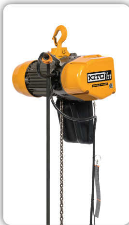
Top Hook Mount