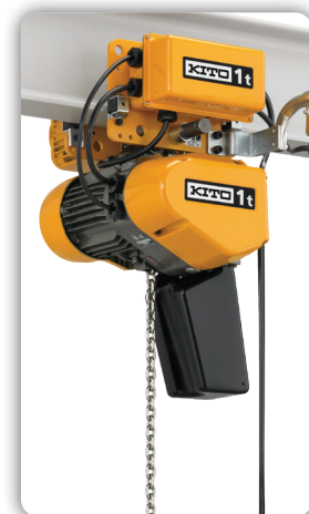
Motorized Trolley Mount