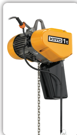
Suspension Bar Mount